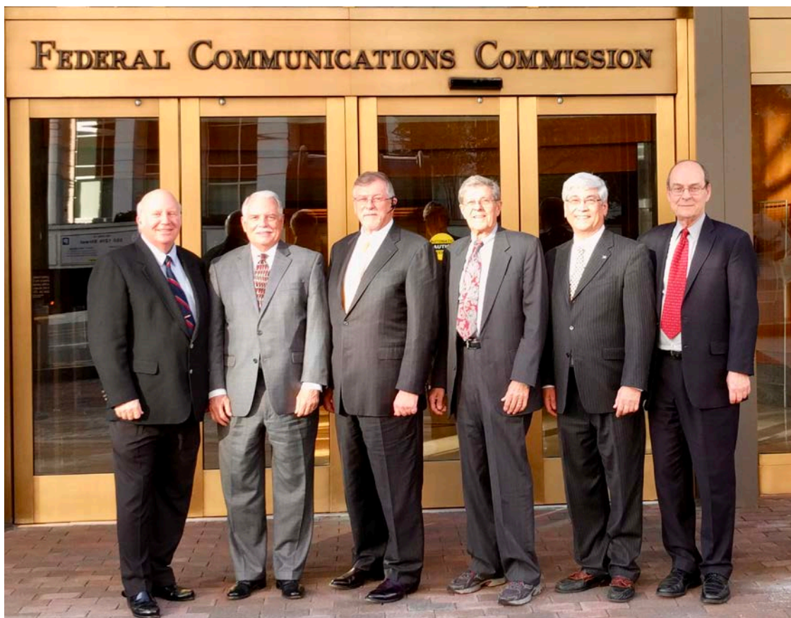
L to R: W3TOM, K5UR, N5AUS, W2RU, K1VR, K3ZJ