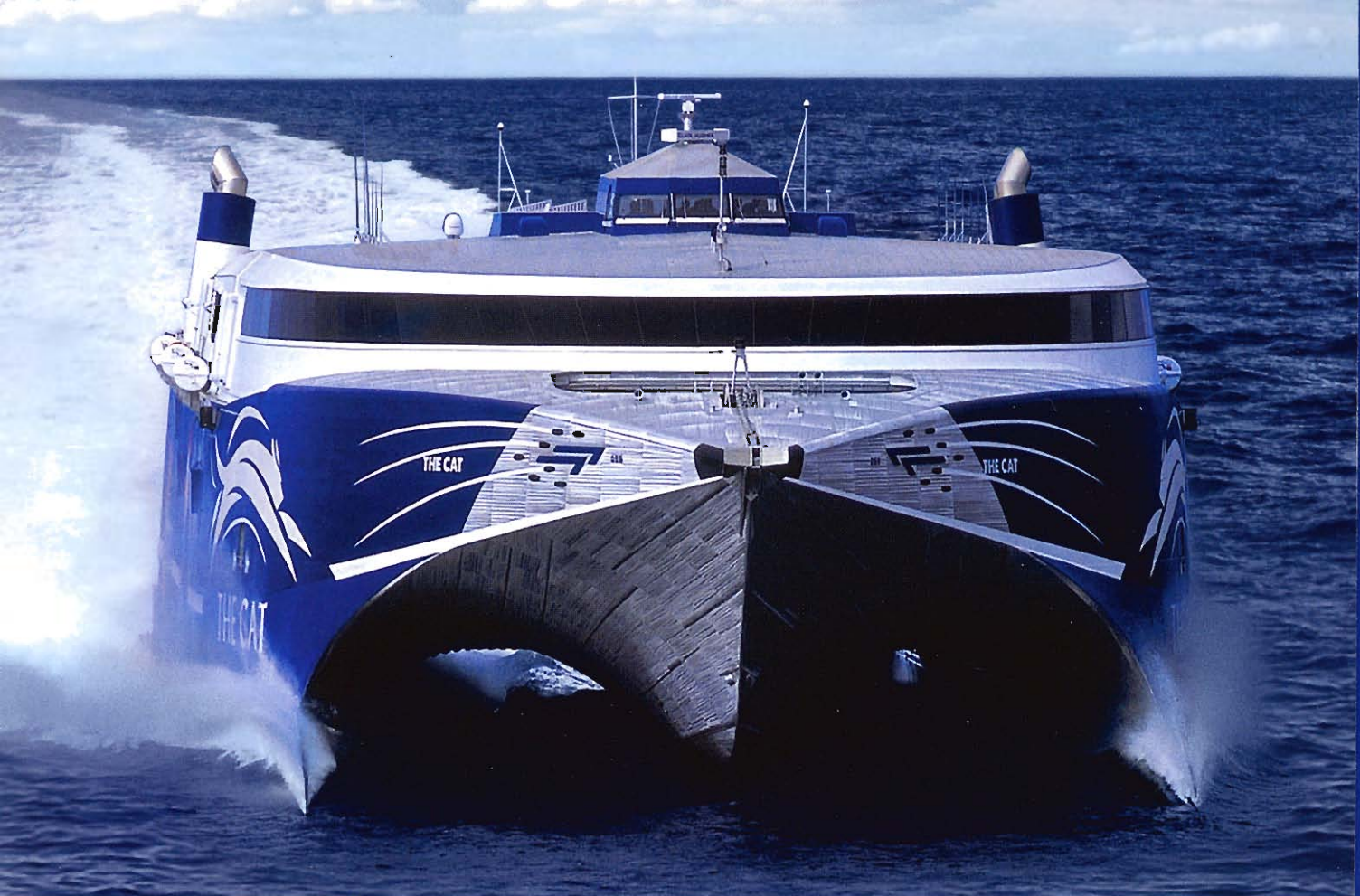
Maine and Nova Scotia on The CAT