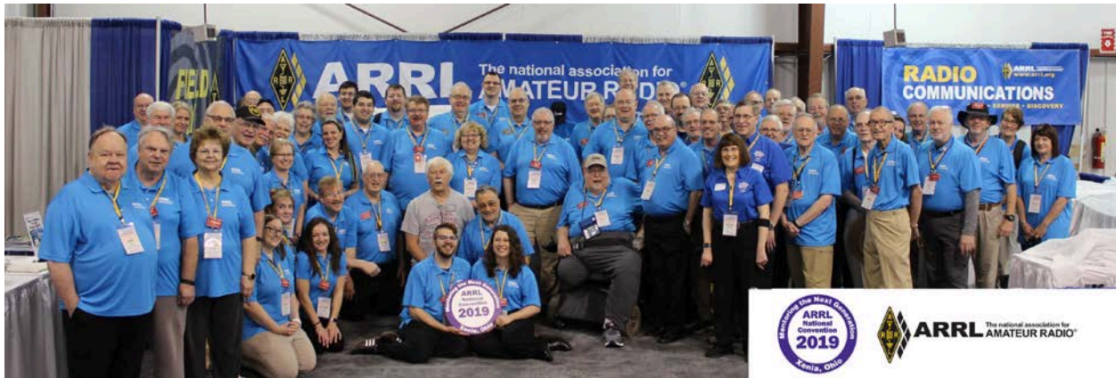
(The above photo includes most of the ARRL staff, ODV, and volunteers who participated at this year's National Convention/Dayton Hamvention.)