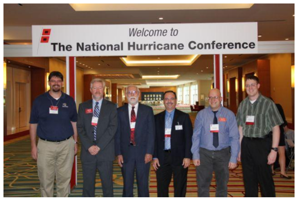
2012 National Hurricane Conference Presenters

The <u>National Hurricane Conference</u> was held in Orlando FL and was well attended by over one-thousand public service, emergency management and amateur radio operators and provides excellent visibility and contact opportunities for ARRL and ARES. The amateur radio sessions were well attended and very productive. One evening of the conference, the local ARES group held a meeting inviting local amateurs that could not attend the conference and conference presenters.