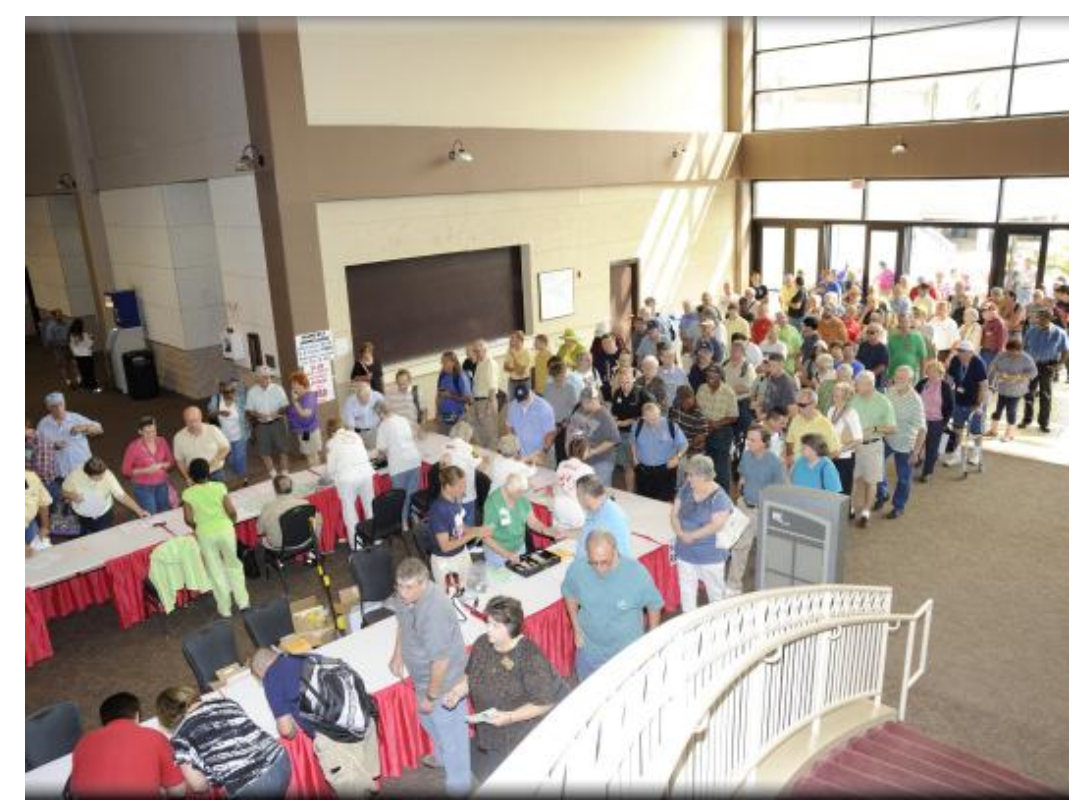
2012 ARRL Southeastern Division Convention, Huntsville Hamfest